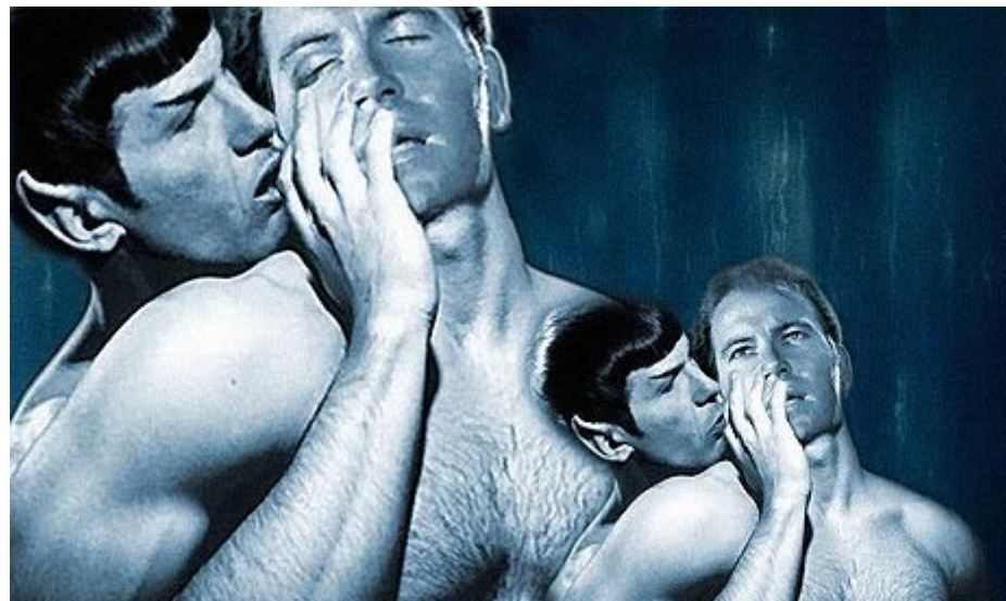
Desert Heat – Spock