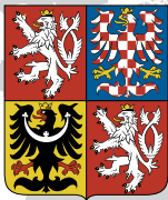
Coat of arms