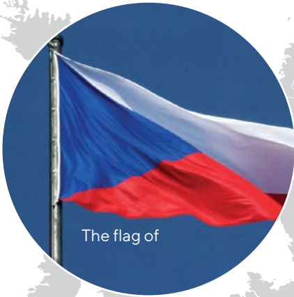
The flag of

The Czech Republic is situated approximately in the geographical centre of Europe and has an area of 78,866 sq. km. It shares borders with Poland in the northeast, Germany in the west and northwest, Austria in the south and Slovakia in the east. The population of the Czech Republic is approaching 10,700,000 and its capital and largest city is Prague (Czech: Praha). The country is composed of the historic lands of Bohemia and Moravia, as well as parts of Silesia. The Czech Republic has been a member of NATO since 1999 and of the European Union since 2004.